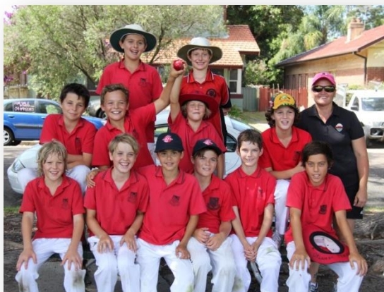
Our victorious cricket team

Congratulations to our cricket team who successfully defeated Belair PS last week. They are heading to Stockton on Thursday to play against Stockton PS. Good luck team!