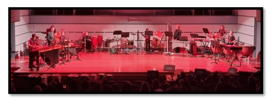
We had the stage all to ourselves

Information about Band, String and Choir Ensembles