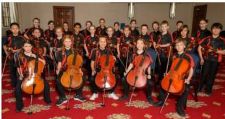
Our winning String Ensemble

Information about Band, Strings and Choir Ensembles